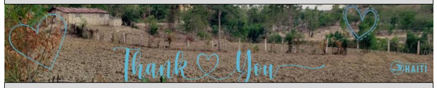
...hope in this life and the life to come...

Thank you so much for your love, support, and generosity towards the Haitian people and RHFH. Your kindness and compassion are amazing and fuel the work going on here in Haiti. On behalf of those featured here in this newsletter and the thousands more, THANK YOU!