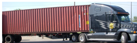
Off to Haiti....