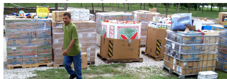
Unloading and Sorting