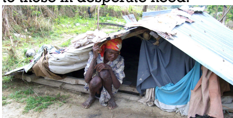
This woman waits at her "home" for her food box.

have been able to give a steady supply of food to 38 households that benefit 237 people. During the current food crisis here in Haiti, this has been a huge blessing for these families. Please continue to pray for these Kingdom connections to get food to those in desperate need.