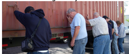
Praying for Protection

RHFH is usually able to send one semi to Haiti every fall for around $10,000 (shipping, customs, fees, transport, etc). Every few years we are blessed with the honor and opportunity of sending two semi trailers full of needed supplies to Haiti. This year was one of those God things where He plans things out so much better than we do. Thank you to those who were obedient to the Lord in their giving! Thank you Lord for making a way for our needs!